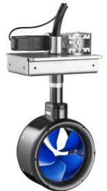
Steerable POD 11.0