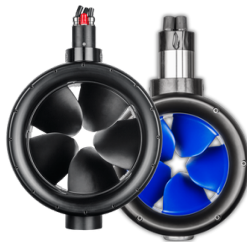
(2x) POD 25.0 (2x) POD 5.0