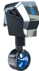
(2x) Steerable outboard 15.0