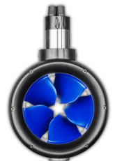
(2x) POD 5.0