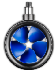
(2x) POD 11.0