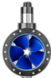
(1x) Bow thruster 11.0