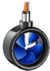
(2x) POD-S 11.0