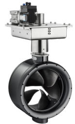
(2x) Steerable POD 50.0