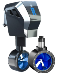
Steerable Outboard 8.0 Bow thruster 5.0