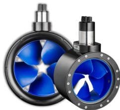
(2x) POD 11.0 Bow thruster 5.0