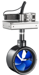
Steerable POD 11.0