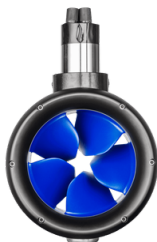
Stern thruster 5.0