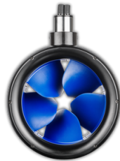
(2x) POD 15.0