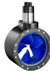
Bow thruster 4.2