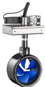
(2x) Steerable POD 3.0