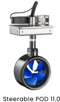
Steerable POD 11.0