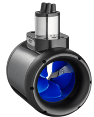
(2x) POD 3.0