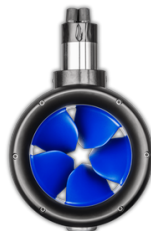
(2x) POD 5.0