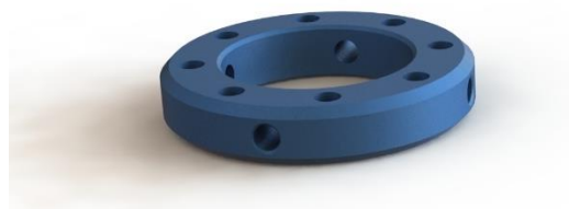
Figure 1: Fastner ring